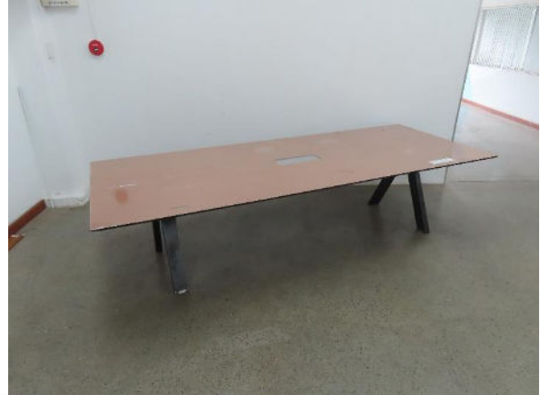
Overall View - After Test