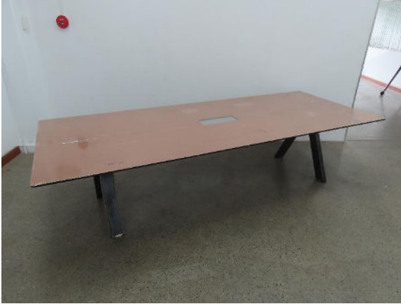
Overall View - Before Test